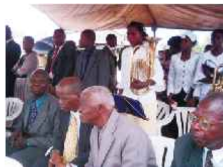
A cross-section of worshippers at the 2006 Cotonou camp meeting

The number of recorded blessings of the camp meeting as announced, apart from the 167 saved, were 95 sanctified, 64 baptised with the Holy Ghost and 12 persons healed.