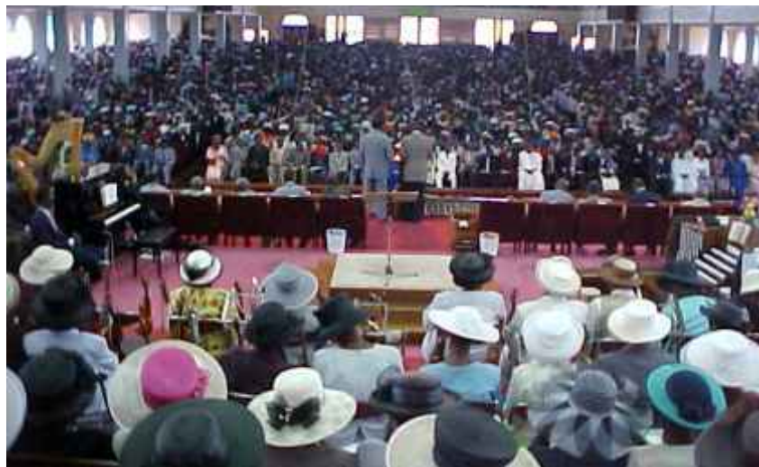
A cross-section of worshippers at The Apostolic Faith camp meeting

The above verses of the Scripture indicate that God commanded the Children of Israel to hold the Feast of (Continued on page 2)