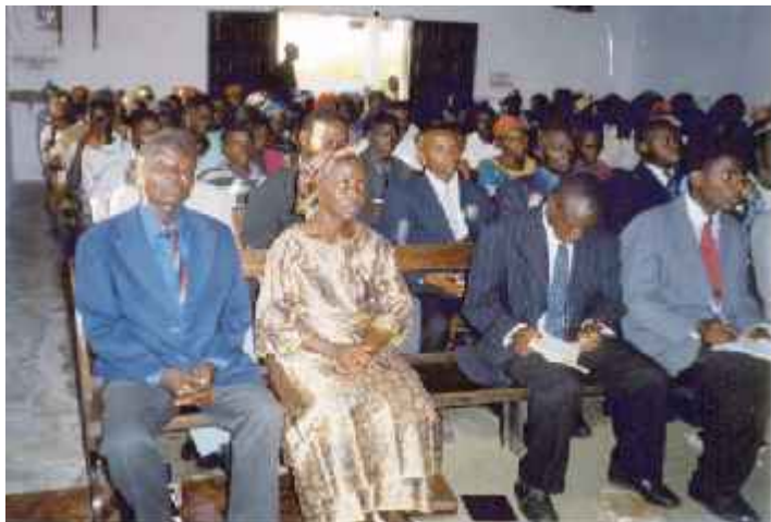
Worshippers at one of the meetings

Heaven literally came down recently in Gaye Town, Monrovia, when The Apostolic Faith Churches in Liberia held their 2006 camp meeting. The two-week event was attended by delegates from across West Africa. It was a unique opportunity to savour the new dawn of peace that recently enraptured the country.