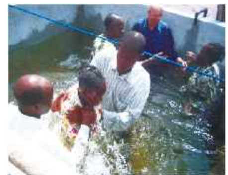
Water Baptism in progress during the 2006 Cotonou camp meeting

Camp meeting helps people to walk on the King's highway of holiness and righteousness. It is a time of refilling of depleted spiritual energy for workers who have laboured in the Lord's vineyard. It is a foretaste of the Great Camp Meeting of all the overcomers which is about to take place. Camp meeting is indispensable.