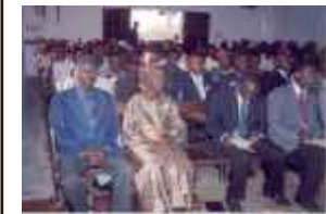
Heaven came down in Liberia Pg 6