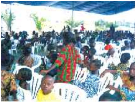
Children at a meeting during a camp meeting

In Nigeria, camp meeting holds during the month of August. In November 1949, the first camp meeting was held at 69, Ibadan Street, Ebute Meta, Lagos. Later, as the congregation increased, the annual camp meetings were held at 22, Simpson Street, Lagos. Due to the