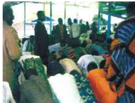
Worshippers seek the face of God

Tuesday through Friday mornings are devoted to intensive Bible