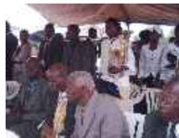
Showers of Blessing Pg 6