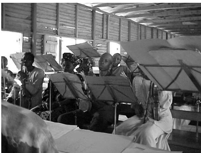
Music Students waiting to be tested in Akure, Ondo State, Nigeria