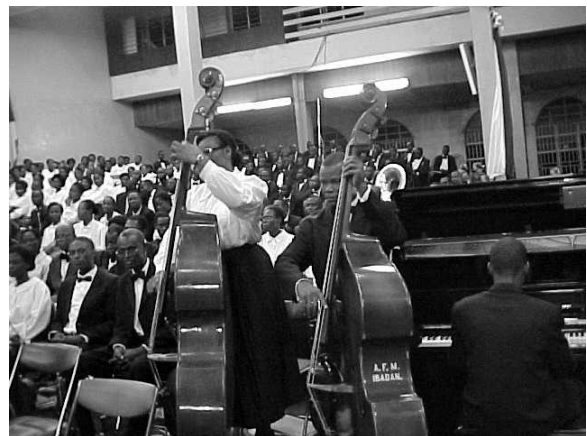
Double Bass section