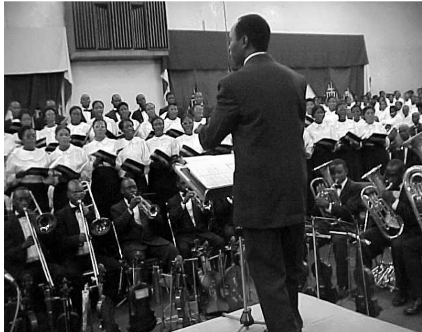
A section of the choir in a concert