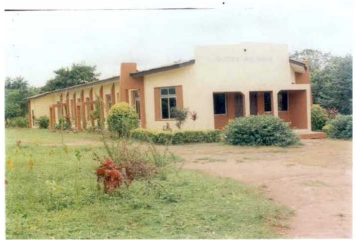
Apostolic Faith Church, Itaogbolu