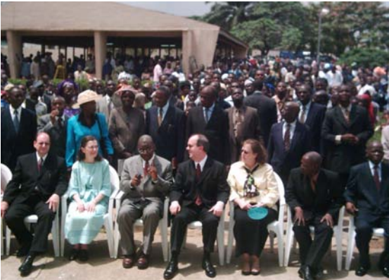
With saints in Lagos