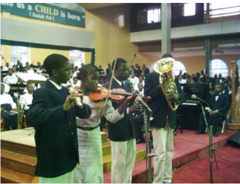
Apostolic Faith Secondary School students, welcoming the visitors