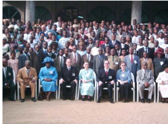
... and Port Harcourt