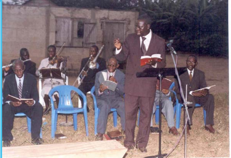
Ministers and choristers in a village

ple salvation messages. The people listened with rapt attention. Some village heads and chiefs also attended. Some people brought seats from their houses and sat around the venue.