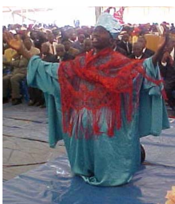
... Prays at Gilgal