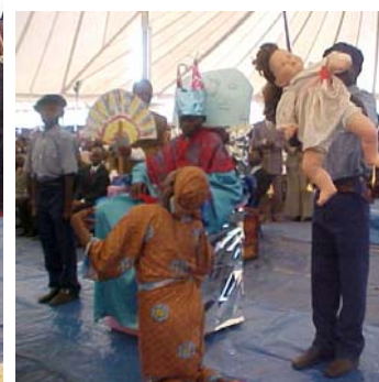
... Judges between Two Women