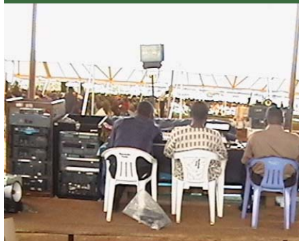
The Recording Crew