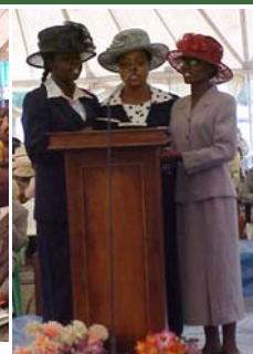
A Female Trio