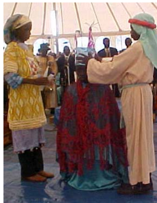
Solomon crowned King by Zadok the Priest and Nathan the Prophet