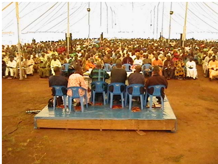
Workers' Conference in Progress