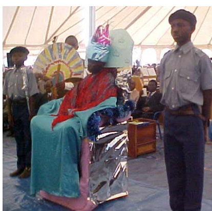
... On His Father's Throne