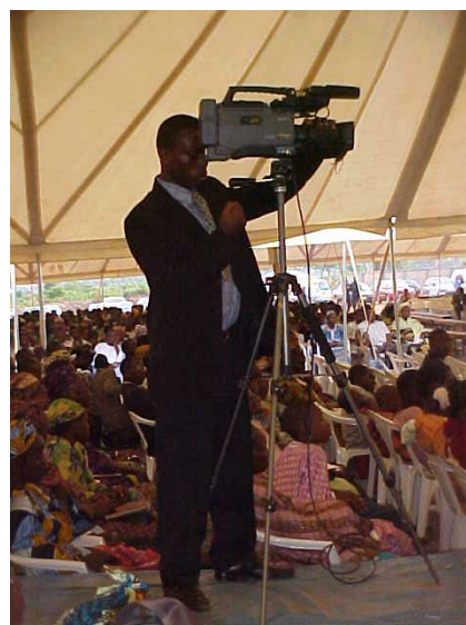
Video Recording in Progress