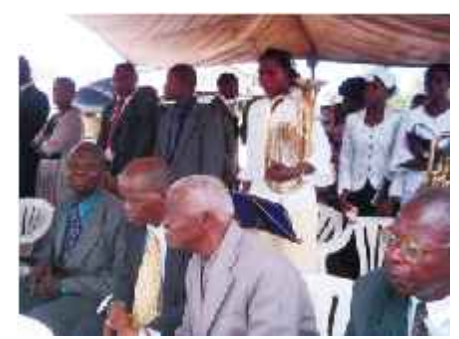
A cross-section of worshippers at the 2006 Cotonou camp meeting

The number of recorded blessings of the camp meeting as announced, apart from the 167 saved, were 95 sanctified, 64 baptised with the Holy Ghost and 12 persons healed.