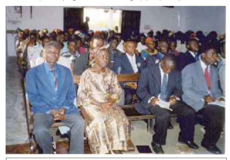
Worshippers at one of the meetings

eaven literally came down recently in Gaye Town, Monrovia, when The Apostolic Faith Churches in Liberia held their 2006 camp meeting. The two-week event was attended by delegates from across West Africa. It was a unique opportunity to savour the new dawn of peace that recently enraptured the country.