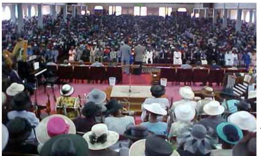
A cross-section of worshippers at The Apostolic Faith camp meeting

The above verses of the Scripture indicate that God commanded the Children of Israel to hold the Feast of (Continued on page 2)