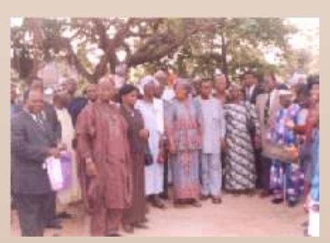
The Missionaries return to base.