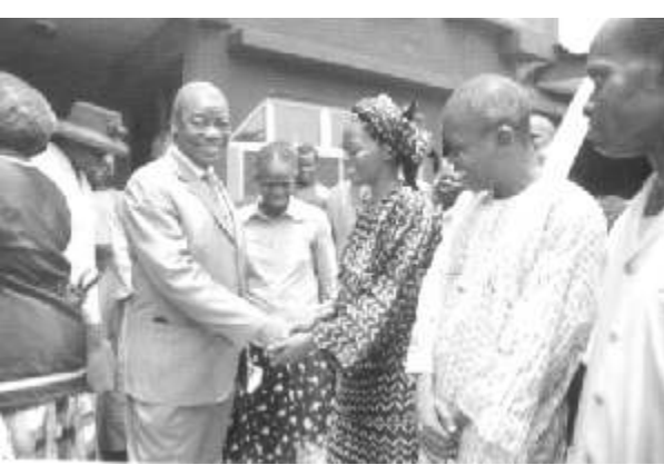
Farewell at Ikot-Enwang

The third phase which covered locations in south-south and south-east of Nigeria, commenced on Monday March 26, 2007. The stations visited were: New-Bussa, Lokoja, Benin-City, Sapele, Onitsha, Yenagoa, Port Harcourt, Calabar, Uyo, Ikot Enwang, Aba, Enugu