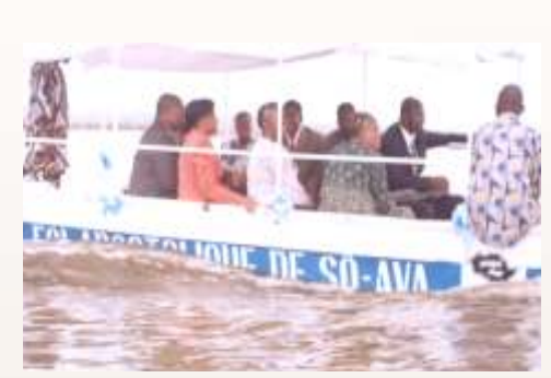
The Gospel boat on water in So-Ava.