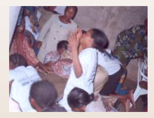
Joy of answered prayers at Parakou.