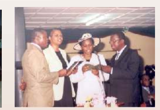
Singing unto the Lord.