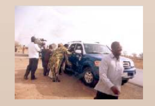
The Train departs Abuja.