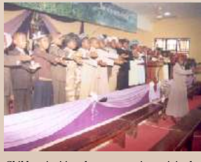
Children inviting the congregation to join the Train at Abuja.