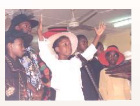
Sunday school pupils in one of the stations.