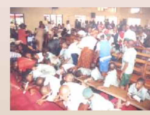
Children praying at one of the meetings.