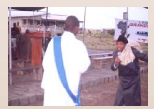
A sketch on repentance.