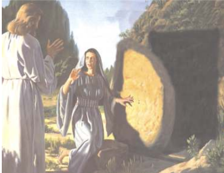
The triumphant resurrection

For every suffering of Jesus, there is a corresponding glory for mankind. If He were not wounded, our transgressions would not have been forgiven. It is so pertinent that even now, a sinner anywhere could plead the Blood of Jesus and be saved from sin. This is made possible because Jesus was bruised that we might be reconciled with God and have peace.