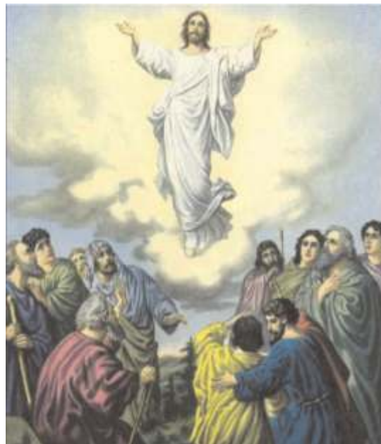
...I go to prepare a place for you

As you ponder the pains and agony Jesus went through, you may make Jesus happy by turning your heart over to Him. This act will bring to your heart the glories associated with Easter. Jesus will be pleased and there will be joy among the angels in Heaven. You can then expect to share in the First Resurrection - the resurrection of the just.